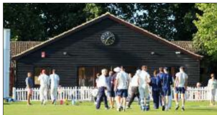
The extended pavilion at Copdock & Old Ipswichian CC.

Phase three, which was carried out over NatWest CricketForce weekend, involved improving the whole area