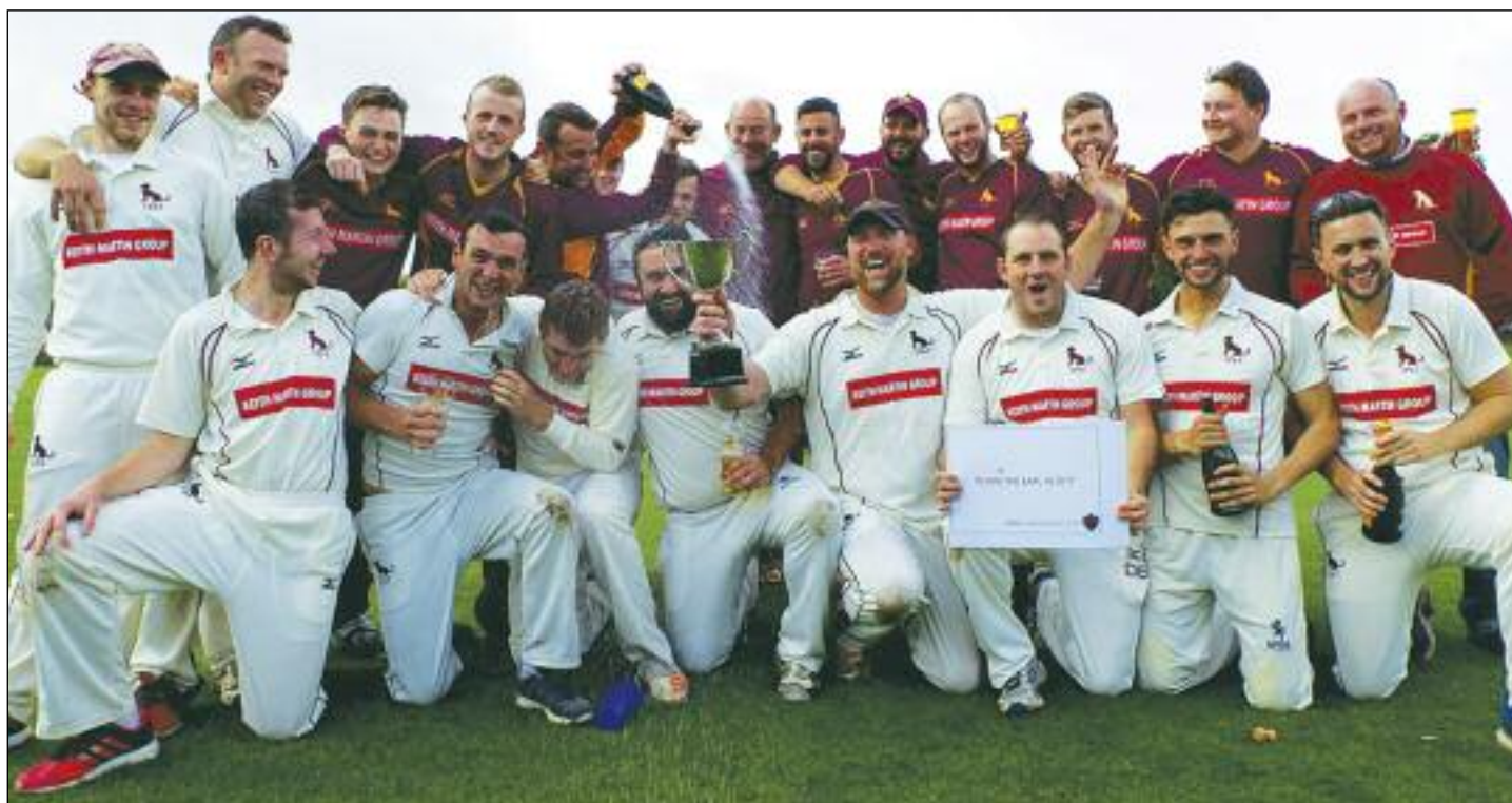
Sudbury's players are joined by members of their 2 nd XI to celebrate the club's first East Anglian Premier League title.

THE 2017 season was one of highs and lows.