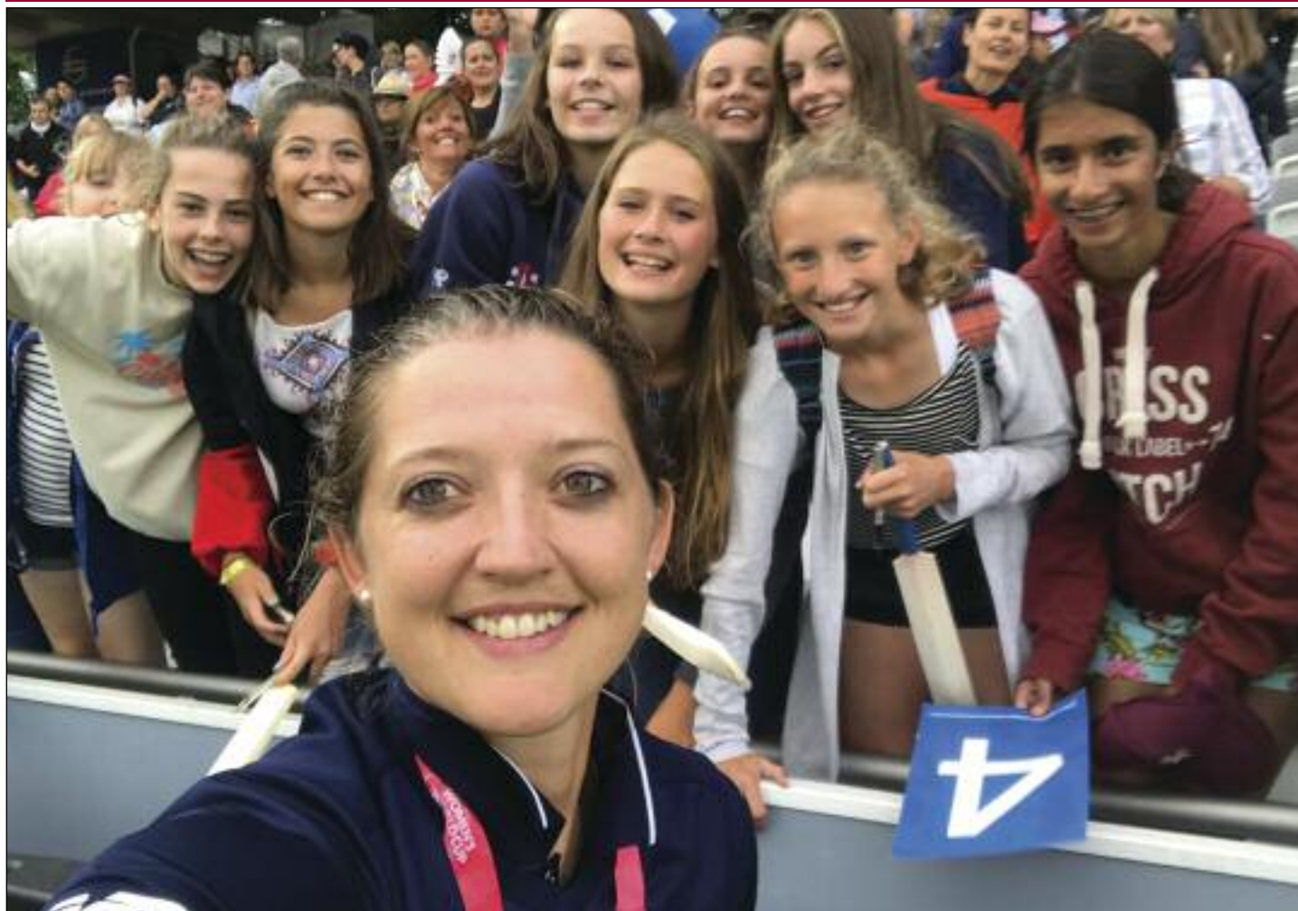
Some of the Under-13s team pictured with England's Sarah Taylor (foreground) after a thrilling Women's World Cup final at Lord's.