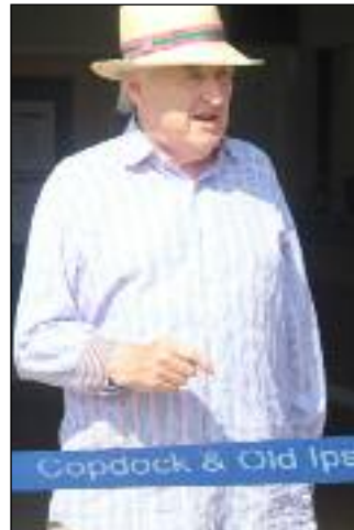
Henry Blofeld prepares to cut the tape to open the pavilion extension at Copdock & Old Ipswichian CC.

The pavilion was opened following the completion of stage three of the redevelopment plan which was finished during the NatWest CricketForce weekend at the start of the season.