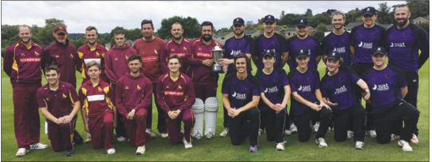
The Sudbury and Haverhill teams with the trophy before the final.